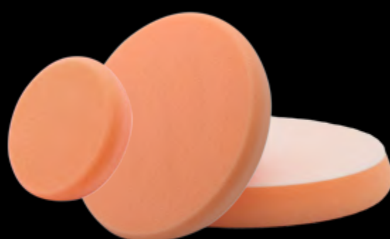
90mm XS320 135mm XS520 155mm XS620