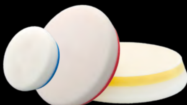
90mm VP300 135mm VP500 155mm VP600