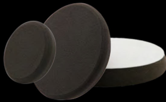
90mm XS360 135mm XS560 155mm XS660