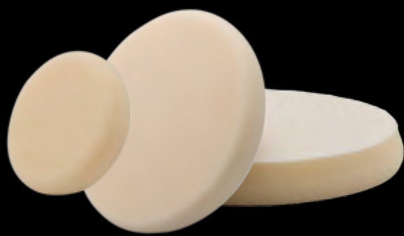
90mm XS380 135mm XS580 155mm XS680