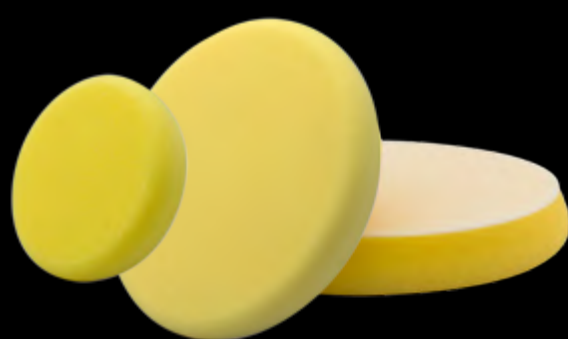
90mm XS340 135mm XS540 155mm XS640