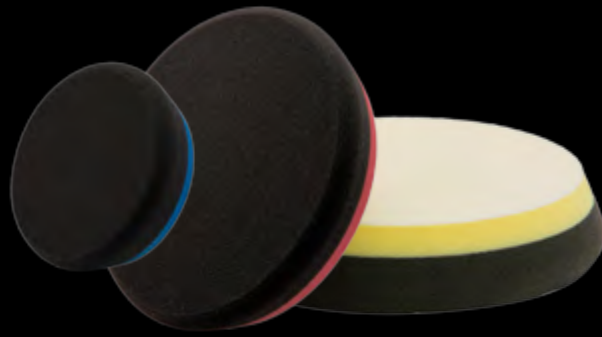
90mm VP360 135mm VP560 155mm VP660