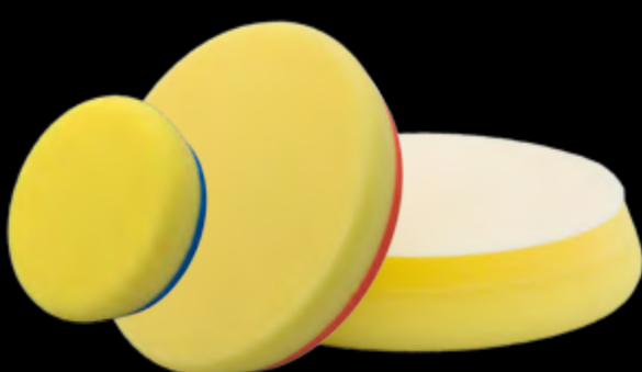
90mm VP340 135mm VP540 155mm VP640