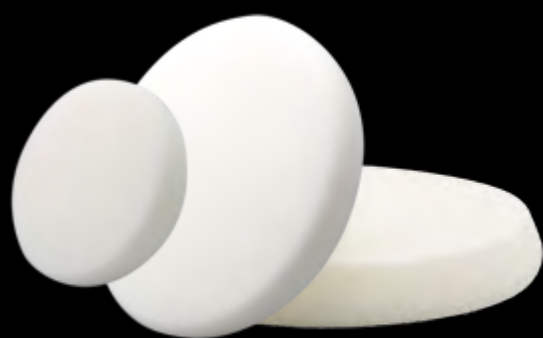
90mm XS300 135mm XS500 155mm XS600